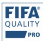
• FIFA Quality PRO