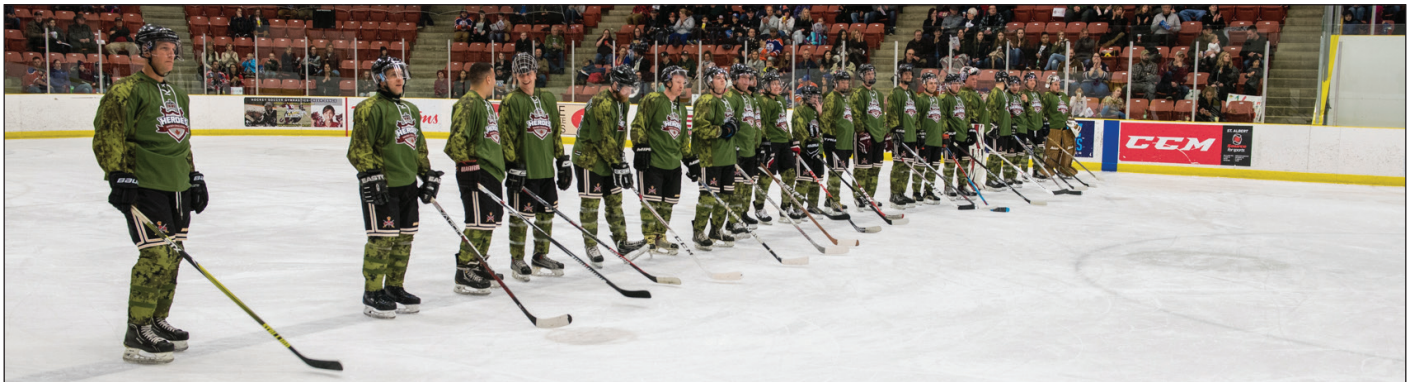
Heroes Hockey Challenge Game 2017