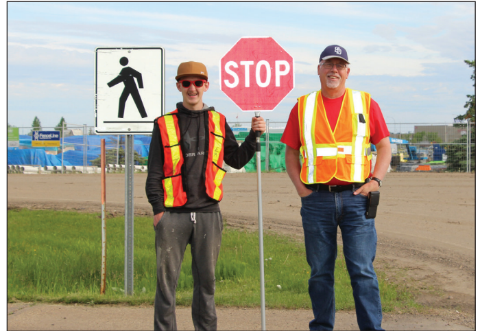
Volunteers stop traffic during the 2017 Loops for the Troops Fun Run

The MFRC provided orientation and training for five selected sponsor volunteers. Those volunteers made five connections through the Airforce Welcome Program.