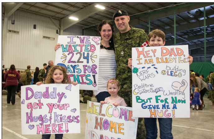
An excited family happy to have their loved one home!

The message that Deployment Support can be accessed even during short-term courses and training is one that the MFRC is continuing to promote. Short spurts away from home come with its own set of challenges, which is why offering support without time-constraints is a priority for the Centre.