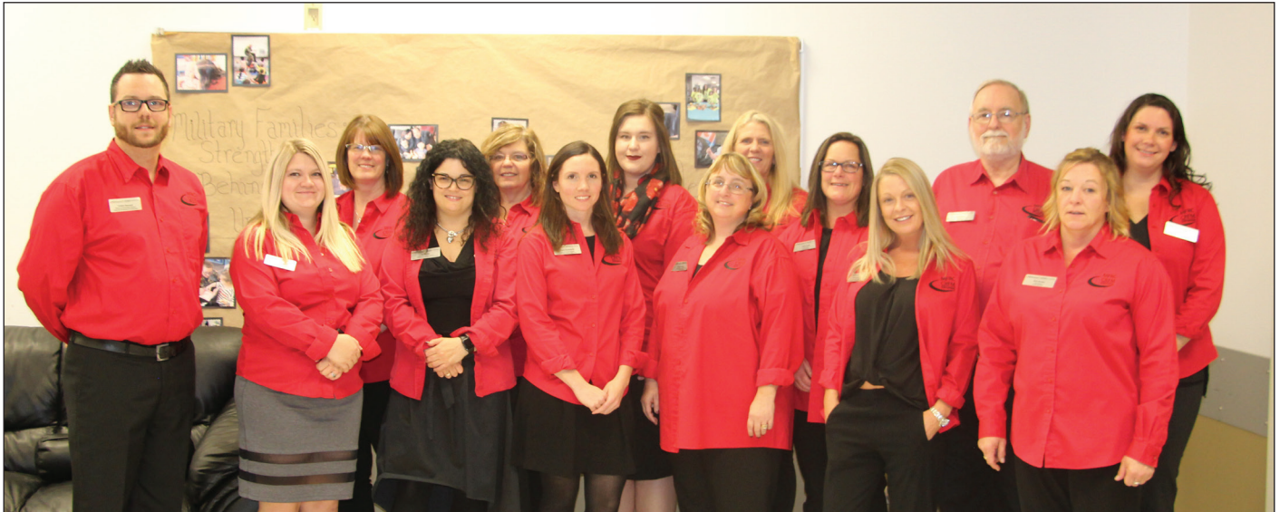
MFRC Staff during the 2017 Donor Appreciation event