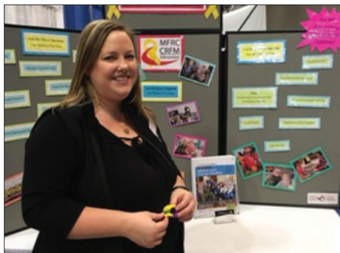
MFRC School Liaison Coordinator attends the North Central Teachers' Convention to connect with local teachers.

493 individuals joined us for our Fall Expo and Community Picnic