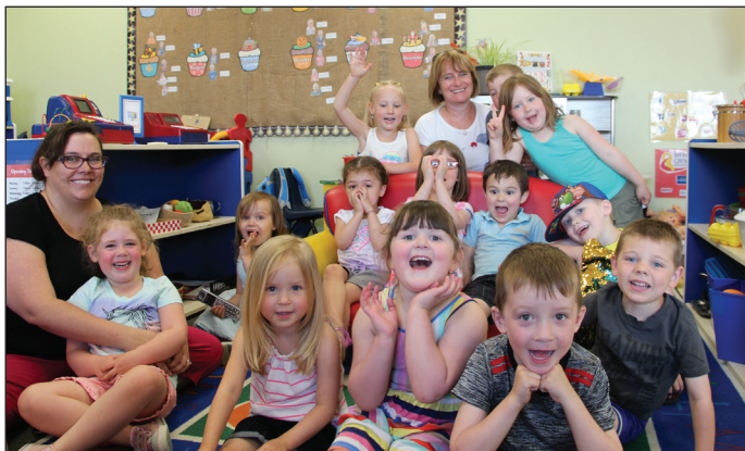
2017/2018 morning Playschool Class