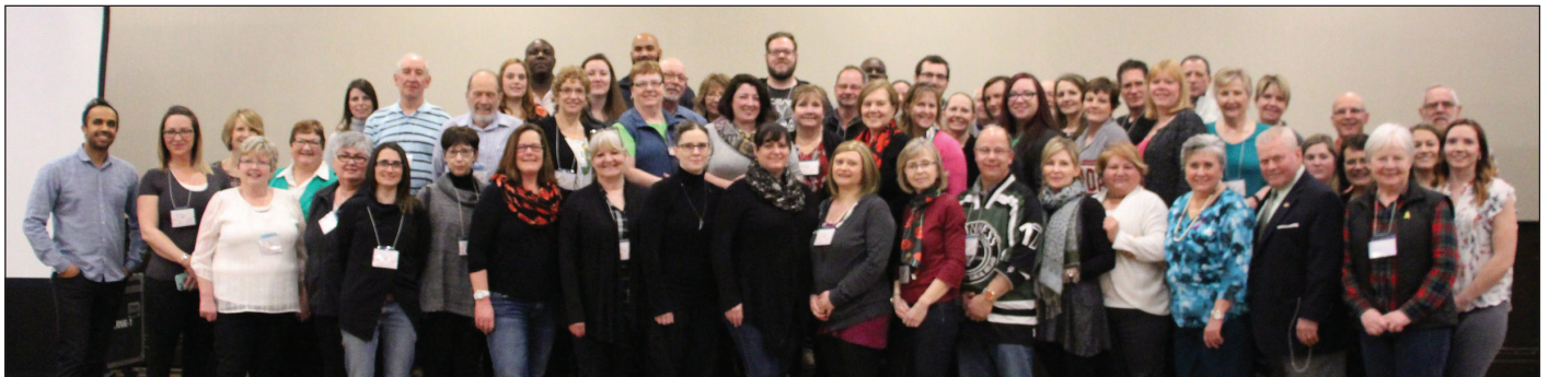
Attendees, Organizers and Speakers from the Strength and Healing Conference