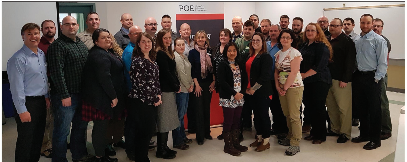
Prince's Operation Entrepreneur attendees