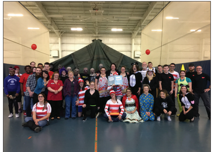
Volunteers help out during the 2017 PSP Halloween event

80 active volunteers attended our Volunteer Appreciation Event on March 10, 2017.