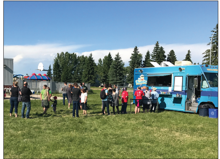
2017 St. Jean Baptiste Celebration

Language Services will be implementing an English language training pilot project, as well as several new programs, including: a walking club, social and educational conferences and various workshops and fun activities for the whole family.