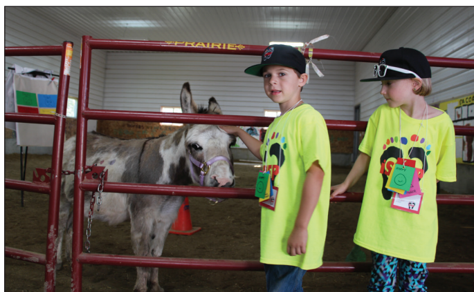
iSTEP Summer Program at the Dreamcatcher Nature-Assisted Therapy Association

The Mental Health Team observed the following challenges, issues and concerns with their clients: