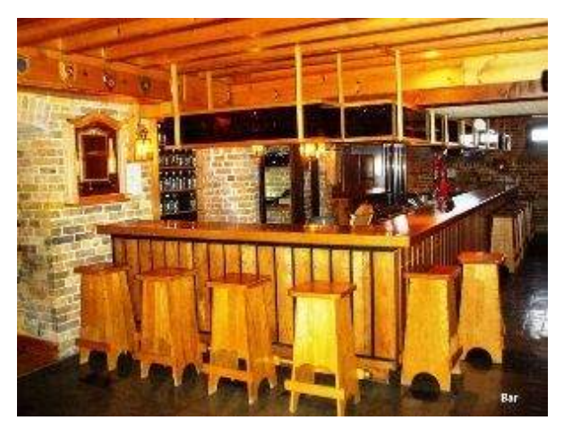
Main bar Officers Mess La Citadelle de Québec

More than 200 Regular and Reserve Canadian Armed Forces messes received NPP dollars for funding entertainment, bar operations, and special events.