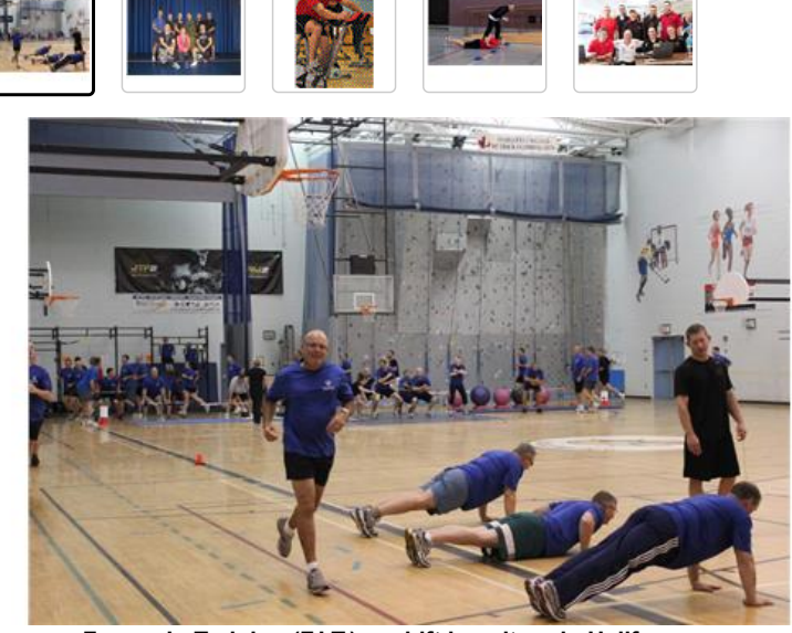
Forces In Training (F.I.T.): a shift in culture in Halifax

As the FORCE Program officially launched 1 April 2013, the new fitness program was well-positioned for success. Over 20,000 members had joined <u>www.DFit.ca</u>, and as word continued to spread about the new FORCE Program, its website had received more than 27,000 hits.