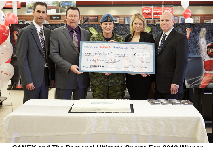
CANEX and The Personal Ultimate Sports Fan 2012 Winner

There are 93,600 Regular and Reserve Force members insured under the SISIP FS LTD plan. Total benefits paid and support provided under the LTD and the Vocational Rehabilitation Program (VRP) reached $106.6M. LTD benefits were paid to 5,038 veterans, and the VRP assisted 3,217 veterans.