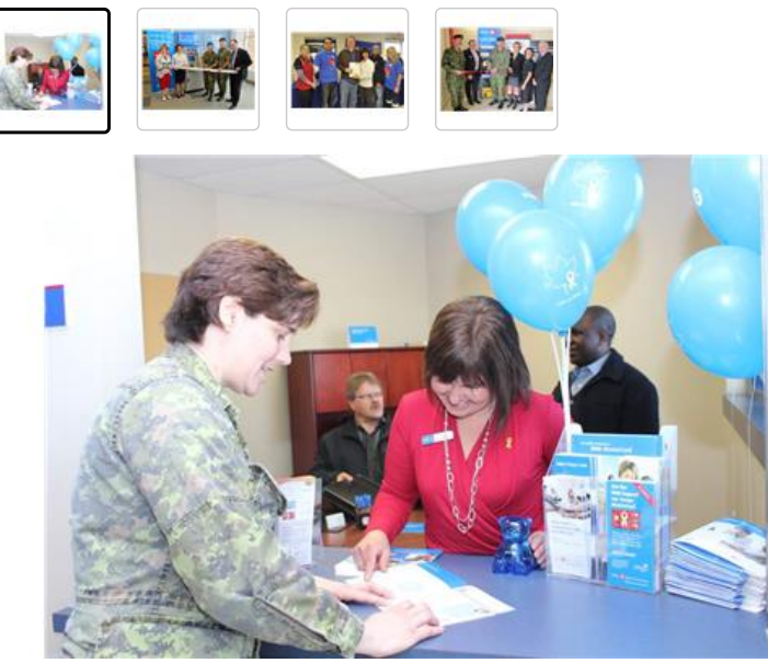
CDCB-BMO office opens at 4 Wing Cold Lake

Last year, CDCB achieved a significant growth across all product categories offered by the program – including investment, mortgages, MasterCard, personal loans, savings accounts and chequing accounts – from 34,396 products used in 2011 to 44,531 products in 2012, an increase of 29.5%.