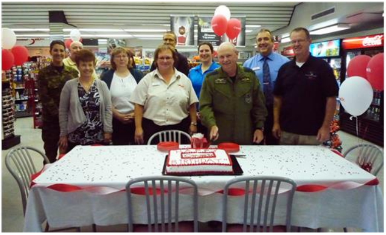
44 candles for CANEX

In September 2012, customers across the country wished CANEX a happy 44th birthday and took advantage of store specials. In Moose Jaw, the military community celebrated the event with the Wing Commander cutting the cake.