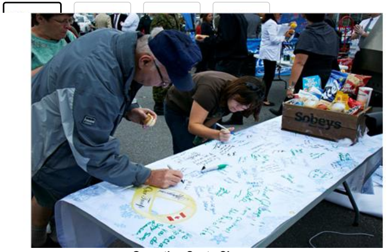
Operation Santa Claus

Residents from Orleans, Ontario, sign a Support Our Troop banner at the 2012 Sobeys Orleans BBQ Operation Santa Claus, a donation drive and send off.