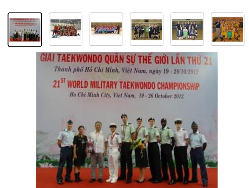
CISM Taekwondo Championship – Ho Chi Minh City, Vietnam

The season closed with the annual Canadian Forces Sports Award Ceremony. The Canadian Forces Sports Awards Ceremony celebrates achievement of our athletes, coaches, and officials for their excellence in sports.